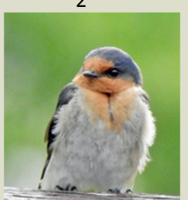
Holland Honeyeater I.Superb Fairy Wren 2. Welcome Swallow 3. New