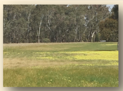
Note the density of Capeweed on the regularly mowed area, compared to the lesser mowed native grass area.