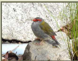
Red Browed Finch