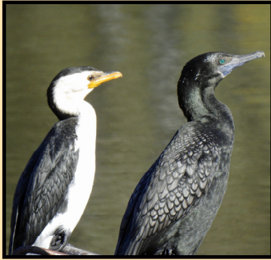
Little Pied and Black Cormorants

Hamilton Park Co- Op Ltd, PO Box 647 Wangaratta 3676 , www.hamiltonpark.org.au